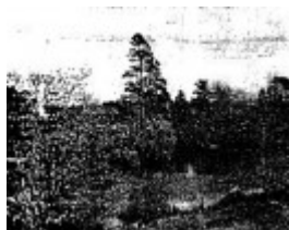
Gardens Conservation Precinct - view of the Gong and gardens from Fiske Street - 1983 Buninyong Conservation Study