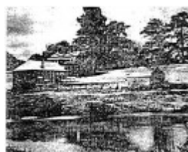
Gardens Conservation Precinct - The brewery and the Gong, looking south to 'Kingshill' - 1983 Buninyong Conservation Study