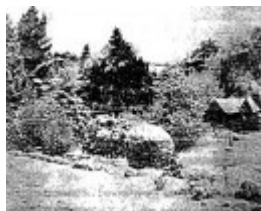
Gardens Conservation Precinct - Buninyong Gardens showing the Bowling Club Pavilion - 1983 Buninyong Conservation Study