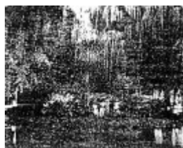
Gardens Conservation Precinct - Buninyong Gardens showing the Half Moon pond - 1983 Buninyong Conservation Study