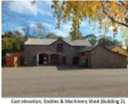
St Joseph's Orphanage