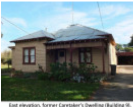
St Joseph's Orphanage