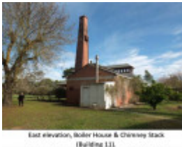
St Joseph's Orphanage