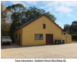
St Joseph's Orphanage