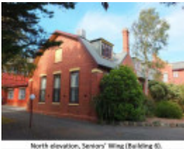
St Joseph's Orphanage