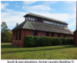
St Joseph's Orphanage