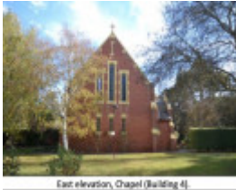
St Joseph's Orphanage