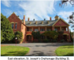
St Joseph's Orphanage