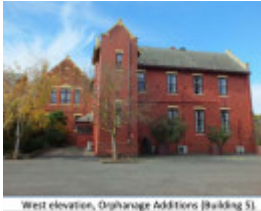
St Joseph's Orphanage