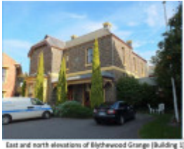
St Joseph's Orphanage