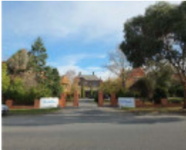
St Joseph's Orphanage