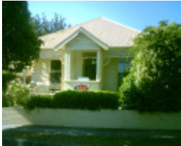
3 Villamanta Street, Geelong West