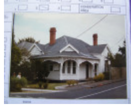
5 Villamanta Street, Geelong West