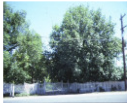
heidi 1 templestowe road bulleen front fence feb1988