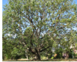
HEIDE 1 SOHE 2008