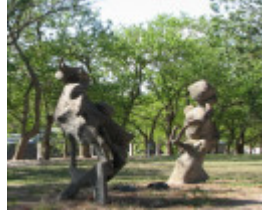
HEIDE 1 SOHE 2008