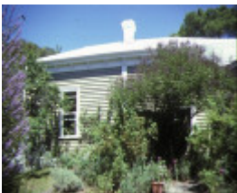
heidi 1 templestowe road bulleen rear view feb1988