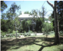
1 heidi 1 templestowe road bulleen front view feb1988