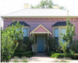
HEIDE 1 SOHE 2008