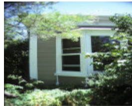
heidi 1 templestowe road bulleen bay window feb1988