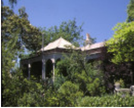
1 talerddig greenhill street castlemaine front view dec1997