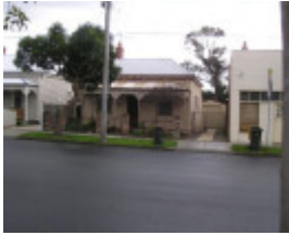
8 Waratah Street, Geelong West