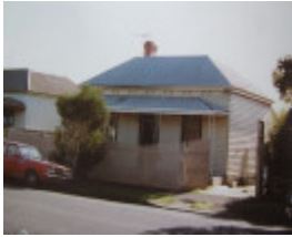
10 Waratah Street, Geelong West