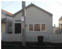
10 Weller Street, Geelong West