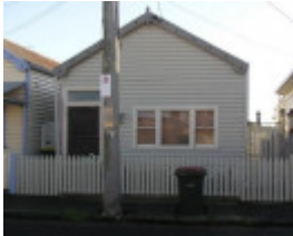
10 Weller Street, Geelong West