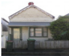
14 Weller Street, Geelong West