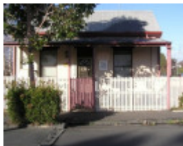
59 Weller Street, Geelong West