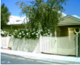
133 Weller Street, Geelong West