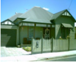
135 Weller Street, Geelong West