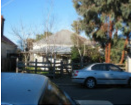
7 Wellington Street, Geelong West