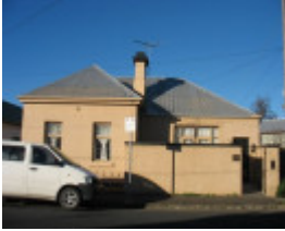
25 Wellington Street, Geelong West