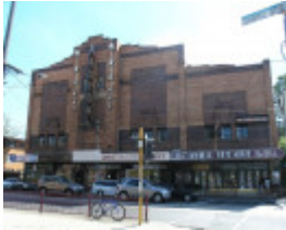
THE ASTOR THEATRE SOHE 2008