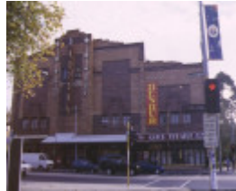
1 astor theatre st kilda front view jun1998