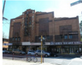
THE ASTOR THEATRE SOHE 2008