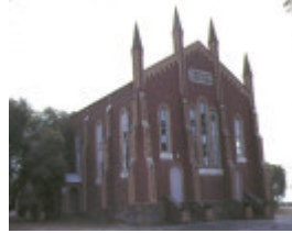
1 former methodist church california gully front view