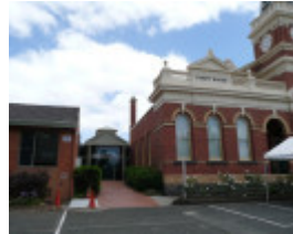
BUNINYONG TOWN HALL SOHE 2008