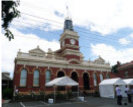
BUNINYONG TOWN HALL SOHE 2008