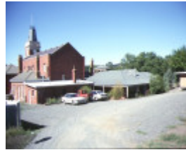
buninyong town hall rear view