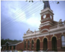
buninyong town hall street frontage dec1987