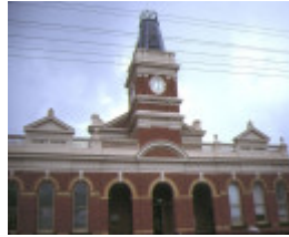
1 buninyong town hall front elevation dec1987