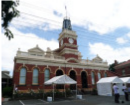
BUNINYONG TOWN HALL SOHE 2008