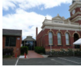
BUNINYONG TOWN HALL SOHE 2008