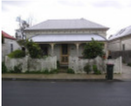
48 Waratah Street, Geelong West