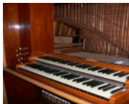
B7640 George Fincham Organ