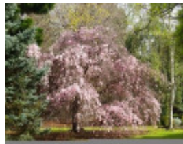
T12164 Pendula Rosea Spring