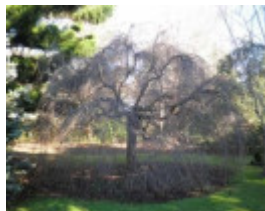
T12164 Pendula Rosea Winter