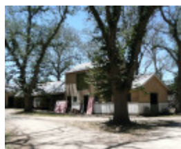
ERCILDOUN SOHE 2008