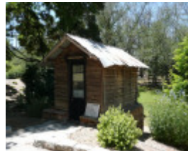
ERCILDOUN SOHE 2008