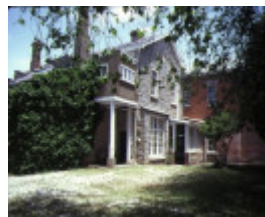
ericildoune homestead burrumbeet sideview of homestead dec83