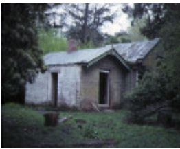
ericildoune homestead burrumbeet gate lodge sep81