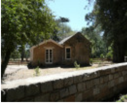
ERCILDOUN SOHE 2008