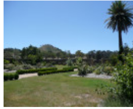
ERCILDOUN SOHE 2008