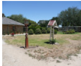
ERCILDOUN SOHE 2008