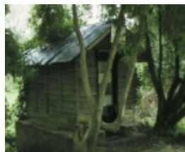
ericildoune homestead burrumbeet original slab hut