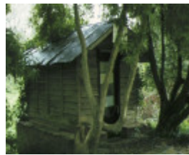
ericildoune homestead burrumbeet original slab hut