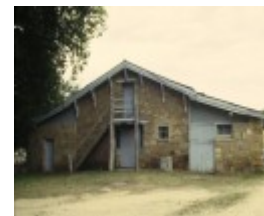
ericildoune homestead burrumbeet stables feb94