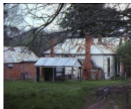
ericildoune homestead burrumbeet managers house oct81