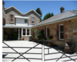
ERCILDOUN SOHE 2008