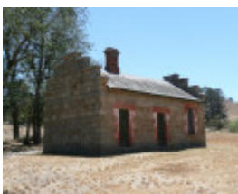
ERCILDOUN SOHE 2008