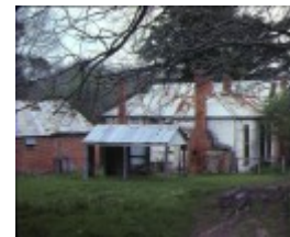
ericildoune homestead burrumbeet managers house oct81