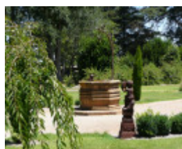
ERCILDOUN SOHE 2008