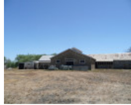
ERCILDOUN SOHE 2008