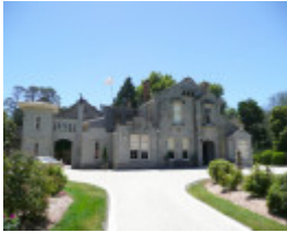
ERCILDOUN SOHE 2008