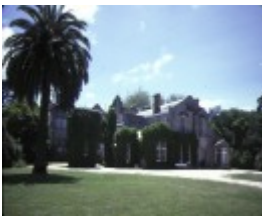
1 ericildoune homestead burrumbeet front view homestead dec83