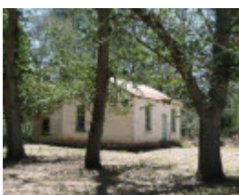
ERCILDOUN SOHE 2008