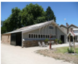
ERCILDOUN SOHE 2008