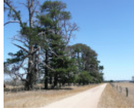
ERCILDOUN SOHE 2008