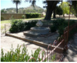
ERCILDOUN SOHE 2008