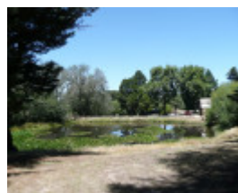
ERCILDOUN SOHE 2008