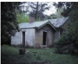
ericildoune homestead burrumbeet gate lodge sep81