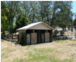
ERCILDOUN SOHE 2008