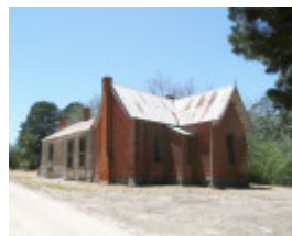
ERCILDOUN SOHE 2008