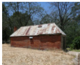
ERCILDOUN SOHE 2008