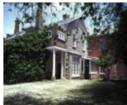
ericildoune homestead burrumbeet sideview of homestead dec83