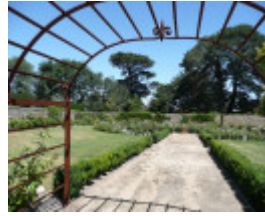
ERCILDOUN SOHE 2008