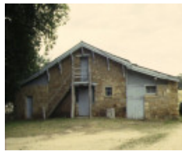
ericildoune homestead burrumbeet stables feb94