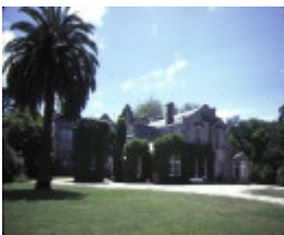
1 ericildoune homestead burrumbeet front view homestead dec83