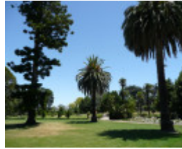
ERCILDOUN SOHE 2008