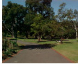
h01887 treasury gardens 1