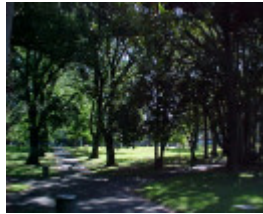
h01887 treasury gardens 4