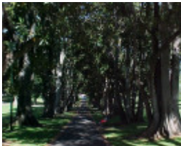
h01887 treasury gardens 2