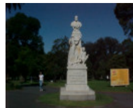
H01887 treasury gardens clarke mar 02 pm1