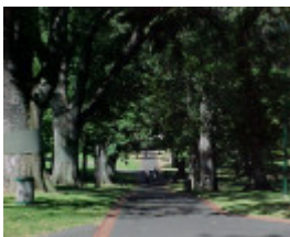
h01887 treasury gardens 6