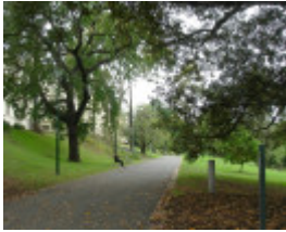
TREASURY GARDENS SOHE 2008