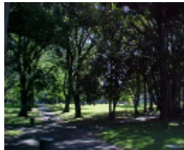
h01887 treasury gardens 4