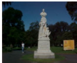
H01887 treasury gardens clarke mar 02 pm1