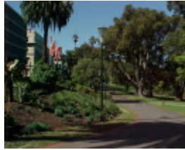
h01887 1 treasury gardens mar 02 pm1