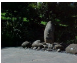
h01887 treasury gardens jfk mar 02 pm1