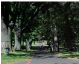
h01887 treasury gardens 6