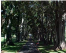
h01887 treasury gardens 2