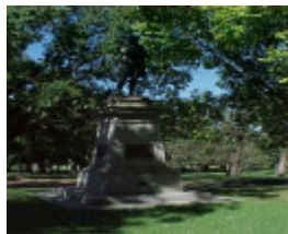
h01887 treasury gardens burns mar 02 pm1