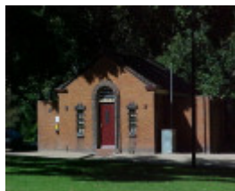
h01887 treasury gardens toilets mar 02 pm1