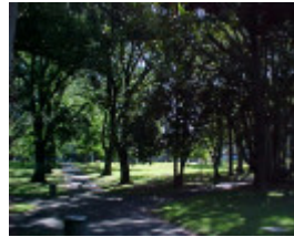
h01887 treasury gardens 4