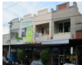
504-510 Lygon Street Brunswick East