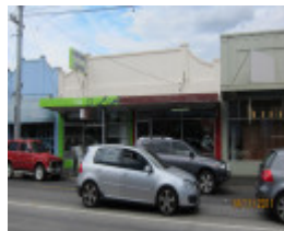
514 & 516 Lygon Street Brunswick East