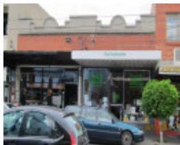
500 & 502 Lygon Street Brunswick East