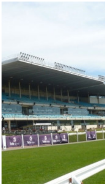
S.R. Burston Stand