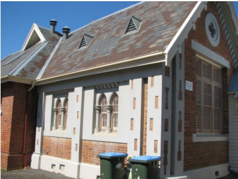
PRIMARY SCHOOL NO.461- FORMER BURWOOD SCHOOL SOHE 2008