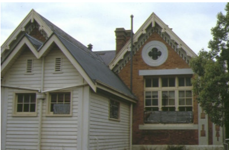
primary school number 461 burwood hwy burwood timber building feb1993