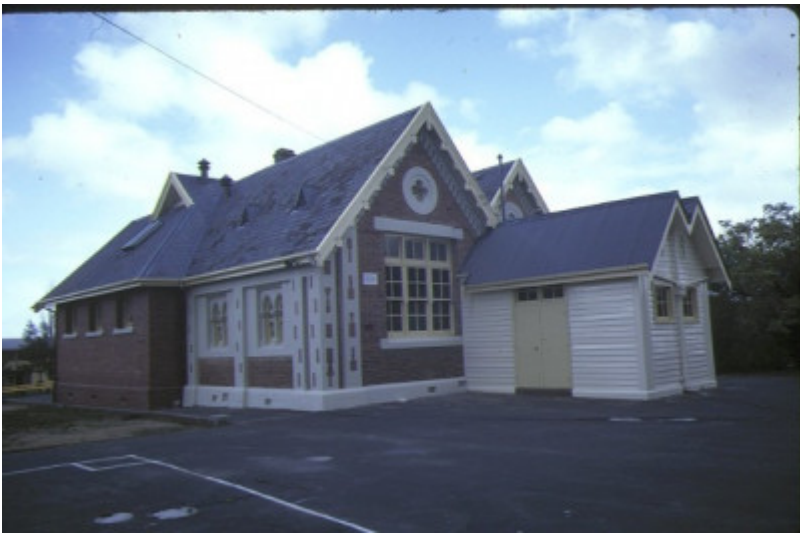
1 primary school number 461 burwood hwy burwood side view sep1984