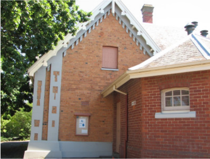
PRIMARY SCHOOL NO.461- FORMER BURWOOD SCHOOL SOHE 2008