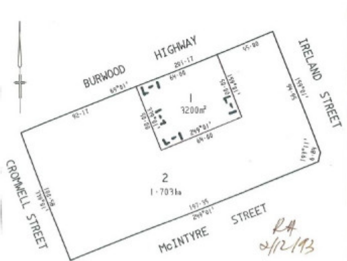
H0975 plan 602601 B