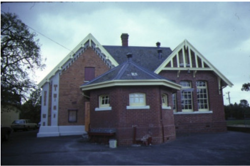
primary school number 461 burwood hwy burwood rounded wing sep1984