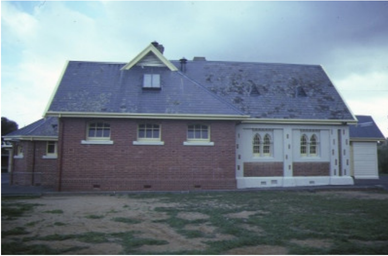
primary school number 461 burwood hwy burwood rear view sep1984