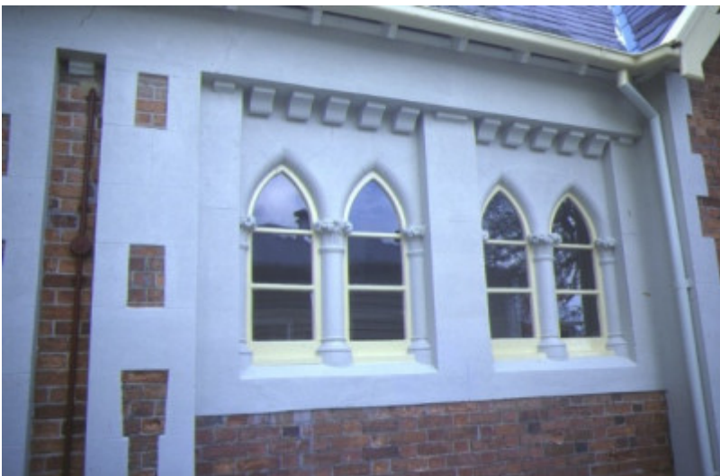
primary school number 461 burwood hwy burwood detail of windows