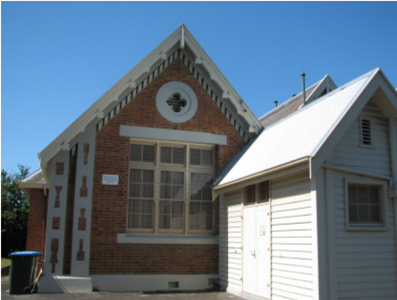
PRIMARY SCHOOL NO.461- FORMER BURWOOD SCHOOL SOHE 2008