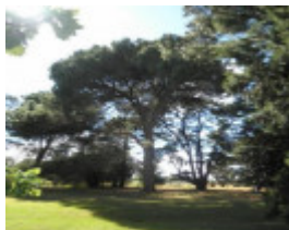
T12171 Pinus halepensis