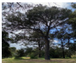
Werribee Park trees - 115