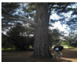
T12171 Pinus halepensis