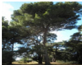
T12171 Pinus halepensis