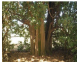
T12173 Lagunaria patersonia subsp patersonia