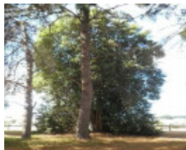
T12173 Lagunaria patersonia subsp patersonia