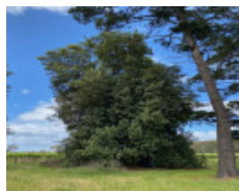
Werribee Park trees - 113