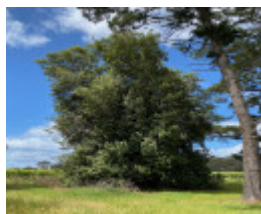
Werribee Park trees - 112