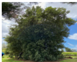
Werribee Park trees - 111