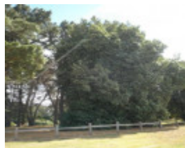
T12173 Lagunaria patersonia subsp patersonia