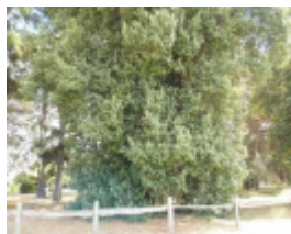
T12173 Lagunaria patersonia subsp patersonia