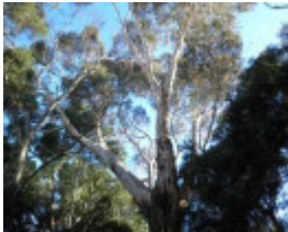
T12174 Eucalyptus cladocalyx