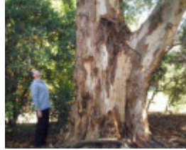
T12174 Eucalyptus cladocalyx