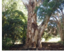
T12174 Eucalyptus cladocalyx