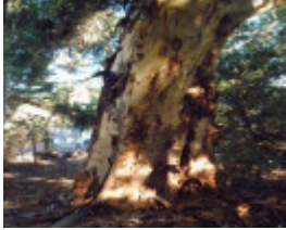
T12174 Eucalyptus cladocalyx