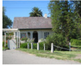
WATTLE PARK SOHE 2008