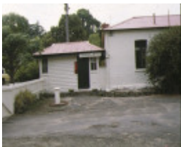
wattle park riversdale road surrey hills former stables and curator's office shelter