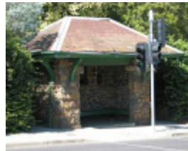
WATTLE PARK SOHE 2008