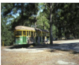
wattle park riversdale road surrey hills w2 class tram picnic shelter