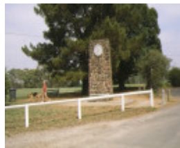
wattle park riversdale road surrey hills memorial clock and tree from lone pine