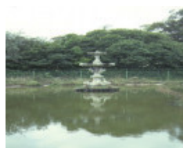
wattle park riversdale road surrey hills fountain