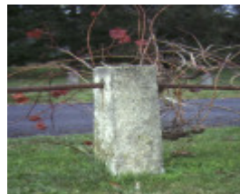
wattle park riversdale road surrey hills fence made from disused cable tram