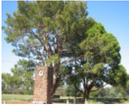
WATTLE PARK SOHE 2008