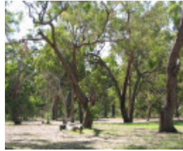
WATTLE PARK SOHE 2008