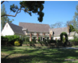
WATTLE PARK SOHE 2008