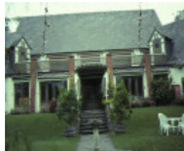
1 wattle park riversdale road surrey hills chalet