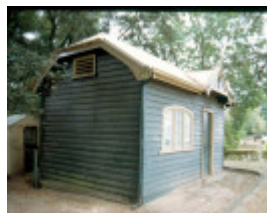
H01994 kyneton botanic gardens gardeners store