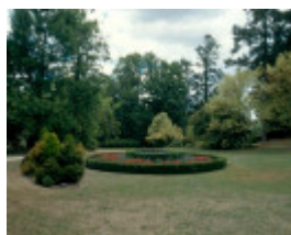
H01994 kyneton botanic gardens1