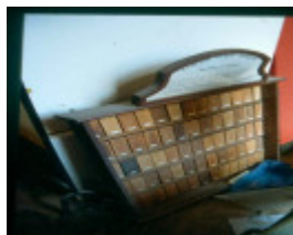
H01994 kyneton botanic gardens specimen board