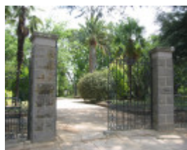
H1994 Kyneton gates