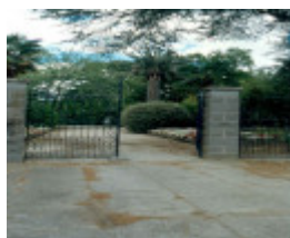
H01994 kyneton botanic gardens gates