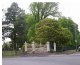
H2185 Hamilton B G Kennedy St western gates