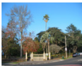
H2185 Hamilton B G Thompson St northern gates