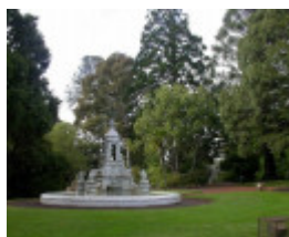
H2185 Hamilton B G Thompson memorial fountain