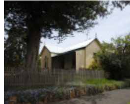
WARRNAMBOOL BOTANIC GARDENS SOHE 2008