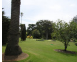
WARRNAMBOOL BOTANIC GARDENS SOHE 2008