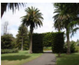
WARRNAMBOOL BOTANIC GARDENS SOHE 2008