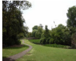
WARRNAMBOOL BOTANIC GARDENS SOHE 2008