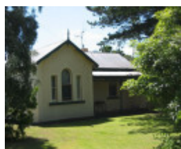
H2090 Warrnambool botanic gardens3 nov05