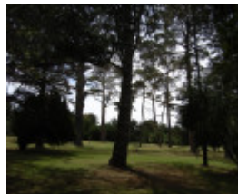
WARRNAMBOOL BOTANIC GARDENS SOHE 2008