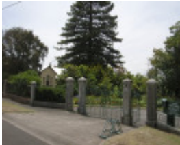
WARRNAMBOOL BOTANIC GARDENS SOHE 2008