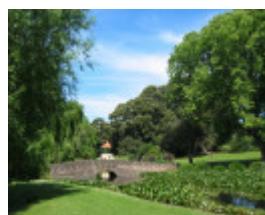
H2090 Warrnambool botanic gardens27 nov05