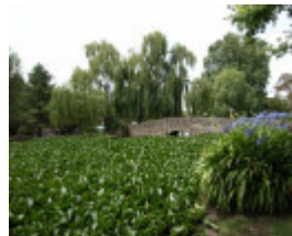
WARRNAMBOOL BOTANIC GARDENS SOHE 2008