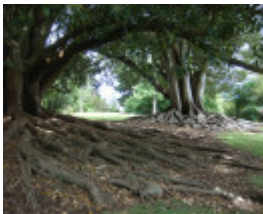
WARRNAMBOOL BOTANIC GARDENS SOHE 2008