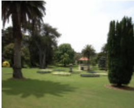
WARRNAMBOOL BOTANIC GARDENS SOHE 2008