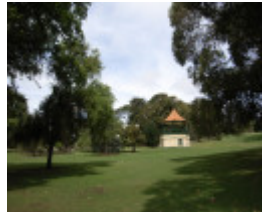
WARRNAMBOOL BOTANIC GARDENS SOHE 2008