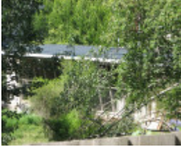
FORMER ROBIN BOYD HOUSE SOHE 2008