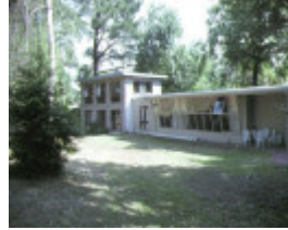
1 former robin boyd house camberwell side view dec1990