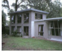
former robin boyd house camberwell double storey section of the house dec1990