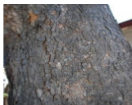
T12175 Corymbia calophylla