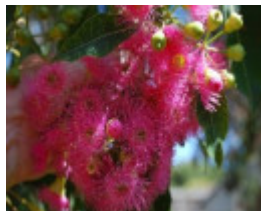
T12175 Corymbia calophylla