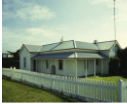
cape otway lightstation residence aug1996