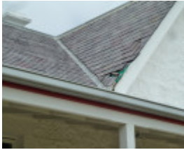
H1222 CAPE OTWAY LIGHTSTATION LHA 2015 8.JPG