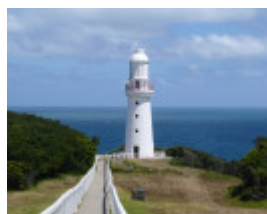
CAPE OTWAY LIGHTSTATION SOHE 2008