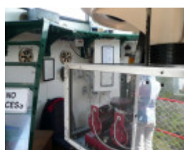
CAPE OTWAY LIGHTSTATION SOHE 2008