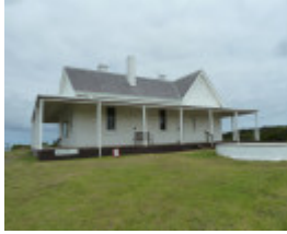
H1222 CAPE OTWAY LIGHTSTATION LHA 2015 7.JPG