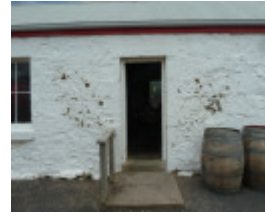
H1222 CAPE OTWAY LIGHTSTATION LHA 2015 4.JPG