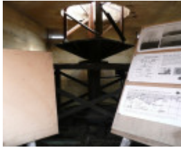
CAPE OTWAY LIGHTSTATION SOHE 2008