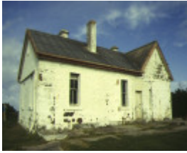
cape otway lightstation signal atation front view aug1996