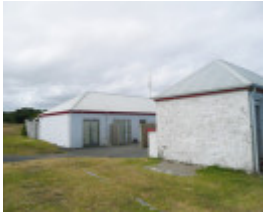
CAPE OTWAY LIGHTSTATION SOHE 2008