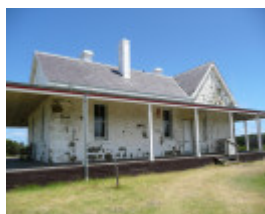
CAPE OTWAY LIGHTSTATION SOHE 2008