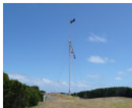
CAPE OTWAY LIGHTSTATION SOHE 2008