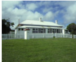
cape otway lightstation front view nov1997