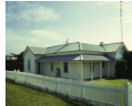
cape otway lightstation residence aug1996