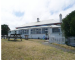
CAPE OTWAY LIGHTSTATION SOHE 2008