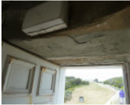
H1222 CAPE OTWAY LIGHTSTATION LHA 2015 2.JPG