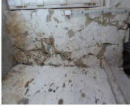
H1222 CAPE OTWAY LIGHTSTATION LHA 2015 5.JPG