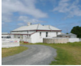
CAPE OTWAY LIGHTSTATION SOHE 2008