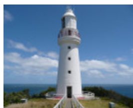
CAPE OTWAY LIGHTSTATION SOHE 2008