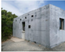
CAPE OTWAY LIGHTSTATION SOHE 2008