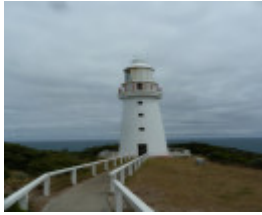
H1222 CAPE OTWAY LIGHTSTATION LHA 2015 1.JPG