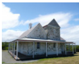
CAPE OTWAY LIGHTSTATION SOHE 2008