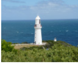
CAPE OTWAY LIGHTSTATION SOHE 2008