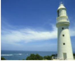
1 cape otway lightstation light house