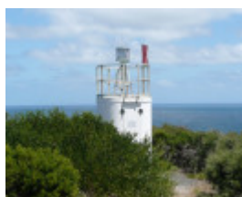
CAPE OTWAY LIGHTSTATION SOHE 2008