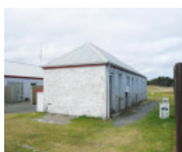
CAPE OTWAY LIGHTSTATION SOHE 2008