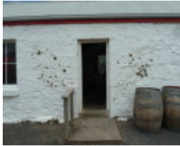
H1222 CAPE OTWAY LIGHTSTATION LHA 2015 4.JPG