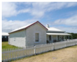
CAPE OTWAY LIGHTSTATION SOHE 2008