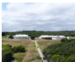
CAPE OTWAY LIGHTSTATION SOHE 2008