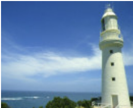
1 cape otway lightstation light house