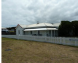
H1222 CAPE OTWAY LIGHTSTATION LHA 2015 3.JPG