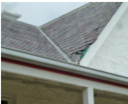
H1222 CAPE OTWAY LIGHTSTATION LHA 2015 8.JPG