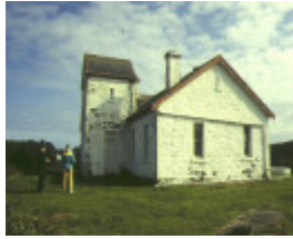
cape otway lightstation signal station rear view aug1996