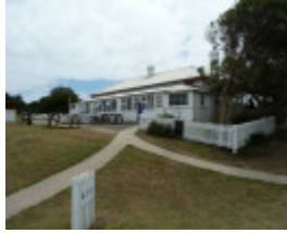
H1222 CAPE OTWAY LIGHTSTATION LHA 2015 6.JPG