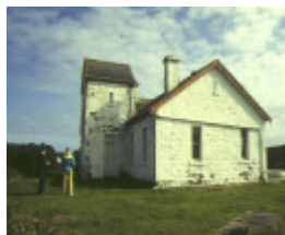
cape otway lightstation signal station rear view aug1996