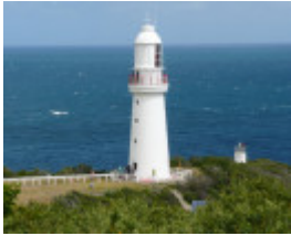
CAPE OTWAY LIGHTSTATION SOHE 2008