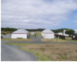
CAPE OTWAY LIGHTSTATION SOHE 2008