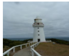
H1222 CAPE OTWAY LIGHTSTATION LHA 2015 1.JPG