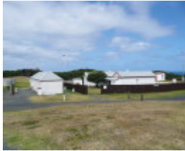
CAPE OTWAY LIGHTSTATION SOHE 2008