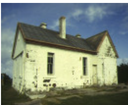
cape otway lightstation signal atation front view aug1996