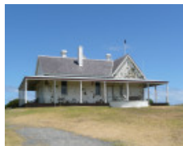
CAPE OTWAY LIGHTSTATION SOHE 2008