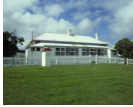
cape otway lightstation front view nov1997