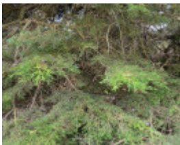
Werribee Park trees - 94