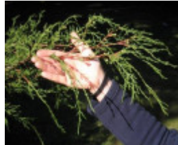
T12179 Hesperocyparis macrocarpa