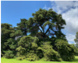
Werribee Park trees - 91