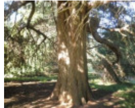
T12179 Hesperocyparis macrocarpa