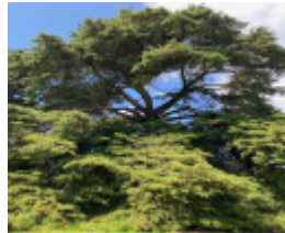
Werribee Park trees - 92