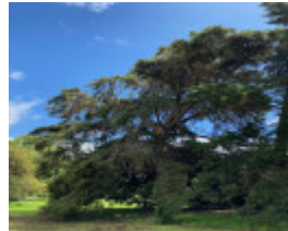
Werribee Park trees - 95