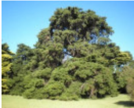
T12179 Hesperocyparis macrocarpa