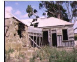
former holy trinity anglican church school merrawarp road cees side view mar1993