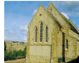
Former Holy Trinity Anglican Church School Merrawarp Road Ceres Rear of Church Publication