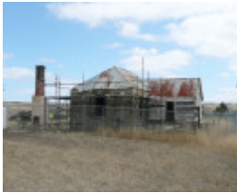
FORMER HOLY TRINITY ANGLICAN CHURCH SCHOOL SOHE 2008