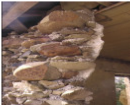
former holy trinity anglican church school merrarp road ceres detail of stone wall