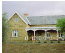
Former Holy Trinity Anglican Church School Merrawarp Road Ceres Vicarage Front View Publication