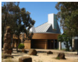
Former Mowbray College library north end