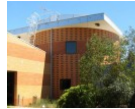
Former Mowbray College library