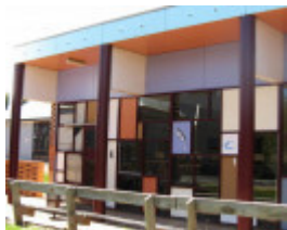
Former Mowbray College Art