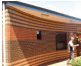
Former Mowbray College admin 1989-97.JPG