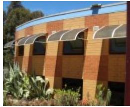
Former Mowbray College Coppin Court