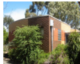
Former Mowbray College toilet block