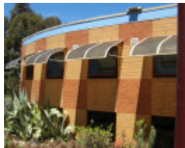
Former Mowbray College Coppin Court