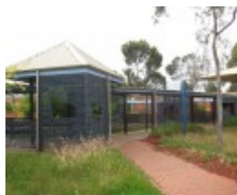
Former Mowbray College walkways