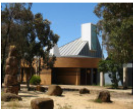
Former Mowbray College library north end