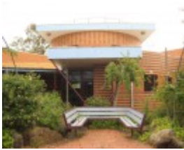
Former Mowbray College library