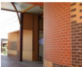
Former Mowbray College art