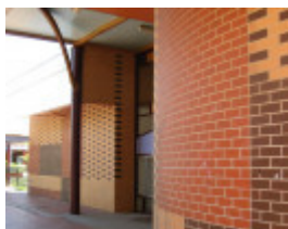
Former Mowbray College art