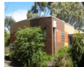
Former Mowbray College toilet block