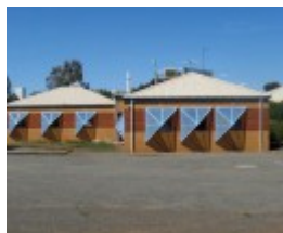
Former Mowbray College science laboratories