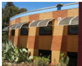
Former Mowbray College Coppin Court