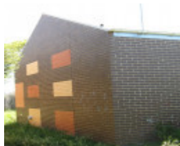
Former Mowbray College classroom