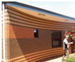
Former Mowbray College admin 1989-97.JPG