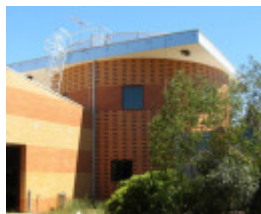
Former Mowbray College library