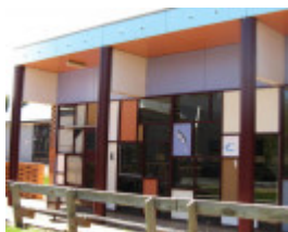
Former Mowbray College Art