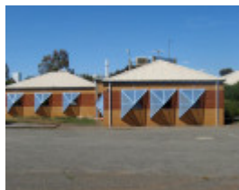
Former Mowbray College science laboratories