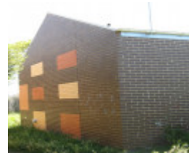
Former Mowbray College classroom