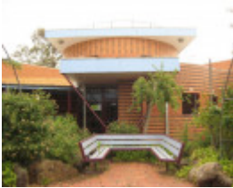
Former Mowbray College library