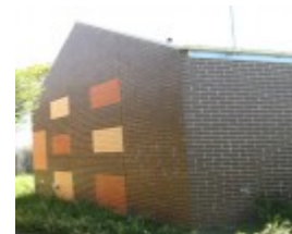
Former Mowbray College classroom