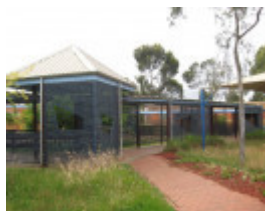
Former Mowbray College walkways