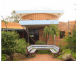
Former Mowbray College library