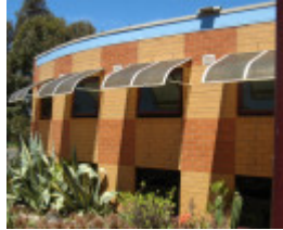
Former Mowbray College Coppin Court