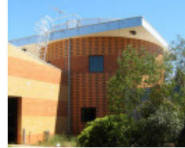
Former Mowbray College library