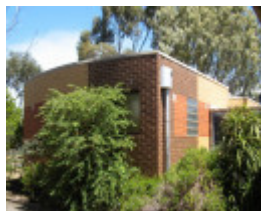
Former Mowbray College toilet block