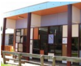
Former Mowbray College Art