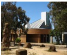
Former Mowbray College library north end