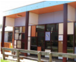
Former Mowbray College Art