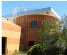
Former Mowbray College library