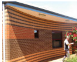
Former Mowbray College admin 1989-97.JPG