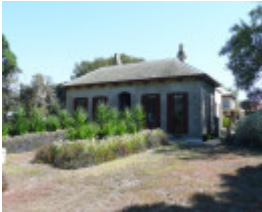
MELALEUKA SOHE 2008