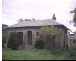
1 melaleuka leopold front elevation may1995