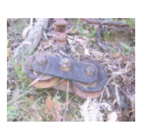
Walhalla Rudy Group 006.jpg