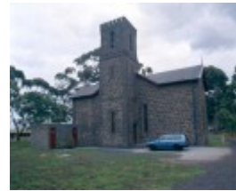
Scots Uniting Church Campbellfield February 2005