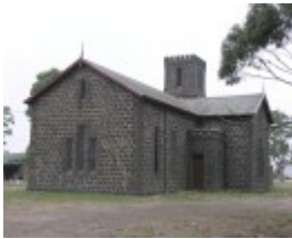
SCOTS UNITING CHURCH SOHE 2008