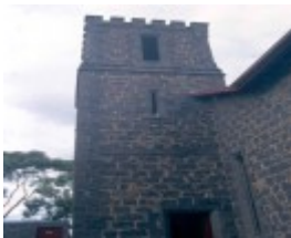
Scots Uniting Church Campbellfield February 2005