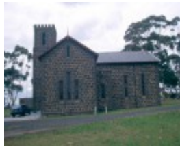
Scots Uniting Church Campbellfield February 2005