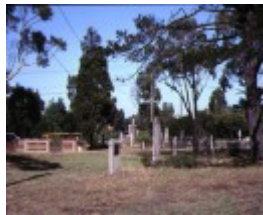
presbyterian church sydney rd campbellfield grounds