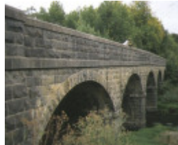
1 bridge over moorabool river batesford side view apr1997