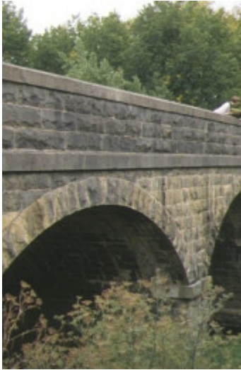
1 bridge over moorabool river batesford side view apr1997