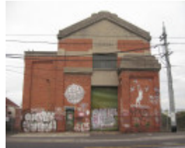
Ascot Vale Substation