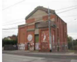
Ascot Vale Substation