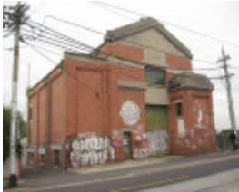
Ascot Vale Substation