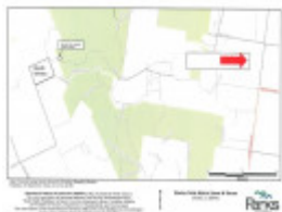
Warby Falls, Dams Weir & Race