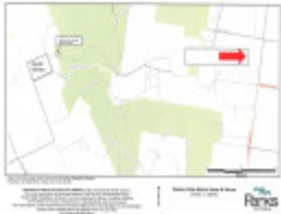
Warby Falls, Dams Weir & Race