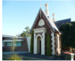
EASTERN CEMETERY GATEHOUSE SOHE 2008