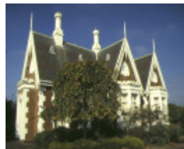
h01170 eastern cemetery gatehouse ormond road geelong front view