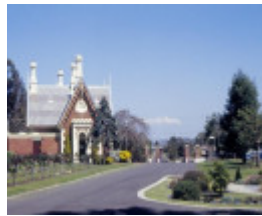
eastern cemetery gatehouse ormond road geelong driveway she project 2003