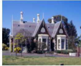
h01170 1 eastern cemetery gatehouse ormond road geelong gatehouse she project 2003