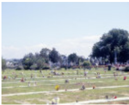
eastern cemetery gatehouse ormond road geelong cemetery she project 2003