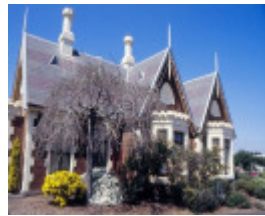
eastern cemetery gatehouse ormond road geelong close up she project 2003