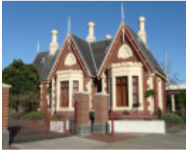
EASTERN CEMETERY GATEHOUSE SOHE 2008