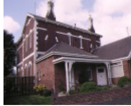
fernshaw western beach geelong rear view aug1995