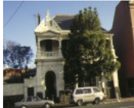
1 the geelong club geelong front view aug1995