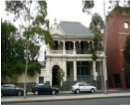
THE GEELONG CLUB SOHE 2008