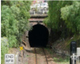
RAILWAY TUNNEL SOHE 2008