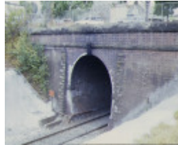
1 railway tunnel geelong colac line geelong front view apr1997