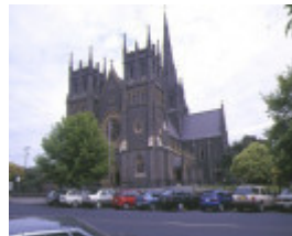
1 st mary of the angles catholic church yarra street geelong front elevation dec1993