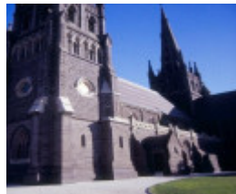
h01026 st mary of the angels catholic church yarra street geelong church exterioro she project 2003