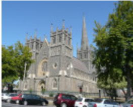
ST MARY OF THE ANGELS CATHOLIC CHURCH SOHE 2008