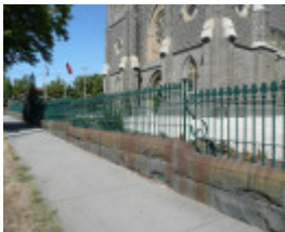
ST MARY OF THE ANGELS CATHOLIC CHURCH SOHE 2008