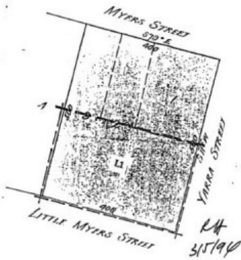
H1026 plan B