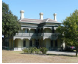
ST MARY OF THE ANGELS CATHOLIC CHURCH SOHE 2008