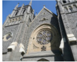
ST MARY OF THE ANGELS CATHOLIC CHURCH SOHE 2008