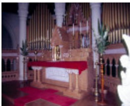
h01026 st mary of the angels catholic church yarra street geelong high altar she project 2003